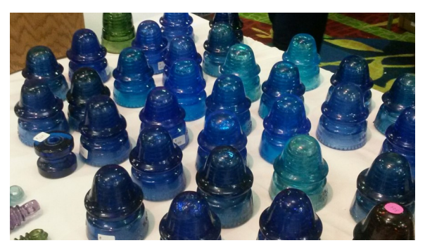
Ross Baird's table was a "sea of blue"!