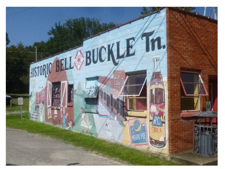
Interesting Bell Buckle, TN mural on local store.